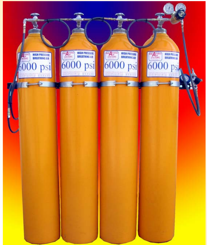
Shown is standard 4-cylinder cascade system with optional regulator.