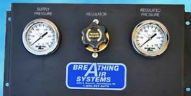
MODEL 671 high pressure MODEL 671LP low pressure with adjustable regulator, 2 gauges