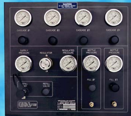
MODEL CC2x4x4M for Mobile Applications

Suggested purchasing specifications on the back of this page