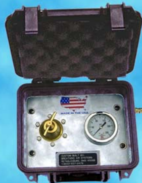
MODEL 669 from 5000 psi in to 100 to 300 psi out