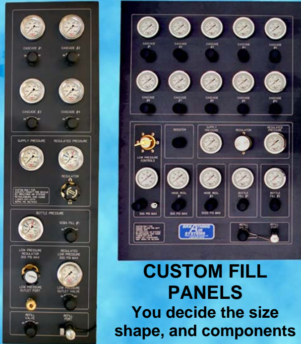
CUSTOM FILL PANELS You decide the size shape, and components

Air control panels for station, or mobile uses. Panels are built to fit your height and width specifications, plus any language or bi-lingual