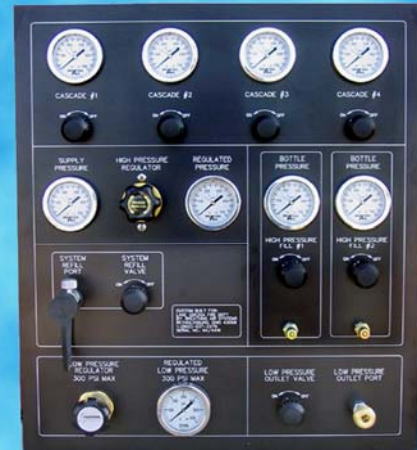
MODEL CC2x4x4MLP for Mobile Applications w/ low-pressure regulator

Air control panels for station, or mobile uses. Panels are built to fit your height and width specifications, plus any language or bi-lingual